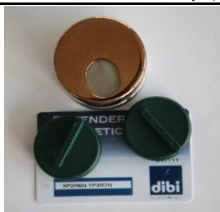
Kit defender "Key Protector" with keys and card